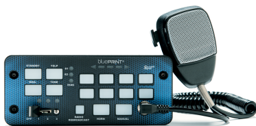
Button option shown