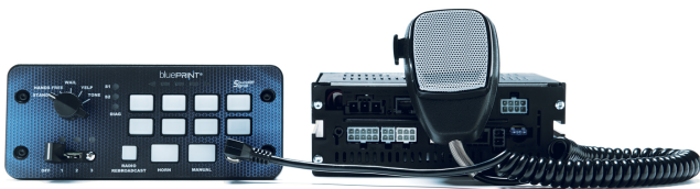
Knob option shown