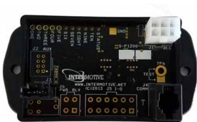
bluePRINT Link Module