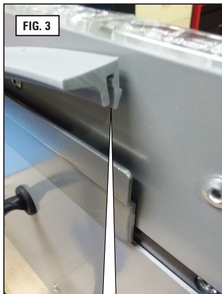
INSERT THE GASKET BETWEEN THE LIGHTBAR AND BRACKET