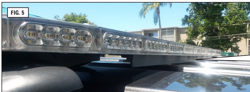
THE GASKET MAY BE TIGHT TO THE ROOF