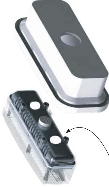
BACK VIEW OF RECESS MOUNT SHOWN