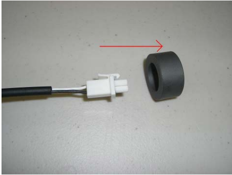
Figure 1 – Feed Through