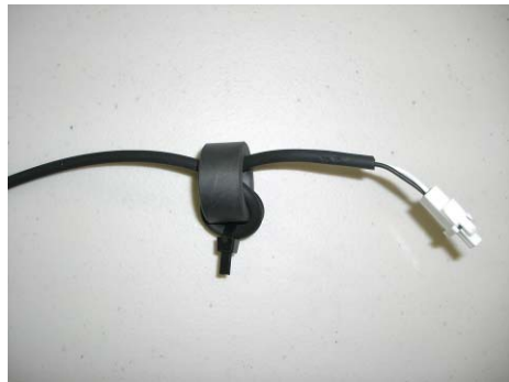
Figure 4 – Zip-tied Wire

NOTE: For maximum efficiency, place the ferrite bead AS CLOSE AS POSSIBLE to the flasher