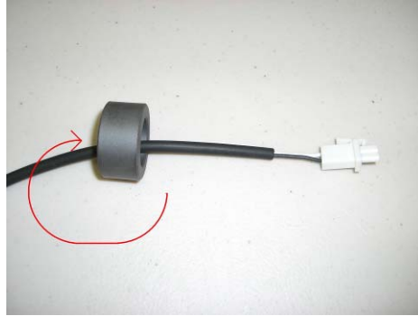
Figure 2 – First Loop