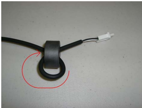
Figure 3 – Second Loop