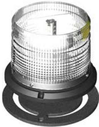
MAGNET MOUNT ELB42BM(z) + (x)(y)