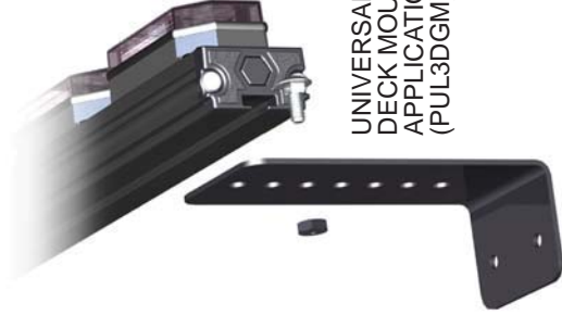
UNIVERSAL FOR DECK MOUNT APPLICATIONS (PUL-3DGM)