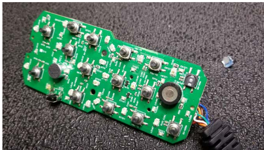
Switch removed from board

The above picture shows the switch removed from the board. Save the parts for future assembly if needed.